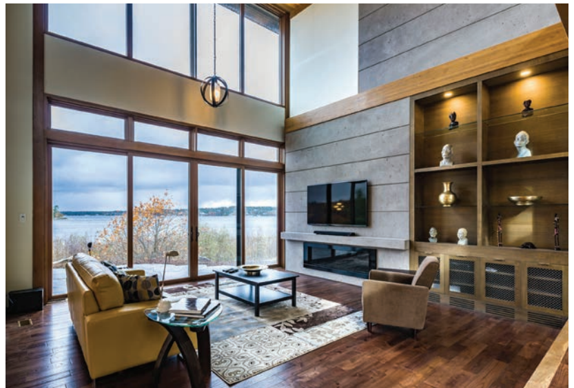
Custom Elements - 70749 ON

In the last seventy-one years, Lindal Cedar Homes has designed and produced over 50,000 homes, built throughout the world in every climate, on every type of terrain, and in every regulatory environment. Since the introduction of its modern design program in 2008, Lindal has been the modern systems-built home of choice for more consumers than all other prefab products combined .