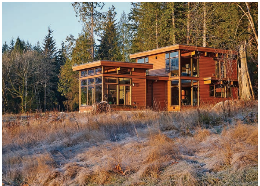
Elements Seafoam 2010 - 70670 BC

Through systematic perpetual estimating – providing estimates at every phase of design – Lindal dealers inform clients of the evolving cost of their home to enable adjustments and to ensure that their Lindal designs will become their great homes.