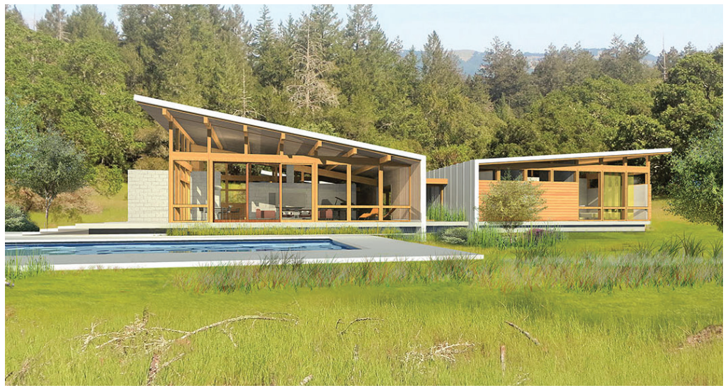
OM Studio Design Aura 3100

Lindal's history celebrates partnerships with renowned architects, beginning with Michael Graves and continuing today with Turkel Design, OM Studios, and the leading firms of the Lindal Architects Collaborative. Architects collaborate with Lindal's design team to create signature designs without compromise, personalized and efficiently delivered, reducing their cost and the time required to go from vision to move-in.