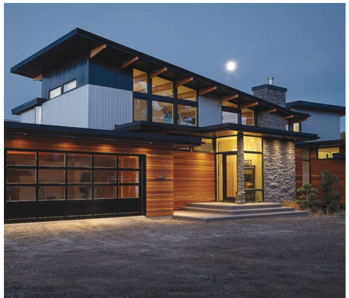
Turkel Design for Lindal - Modified TD3 2990 - 70721 BC

The Lindal system emphasizes the efficient use of all resources – time, material, energy and human resources – from day one until forever.