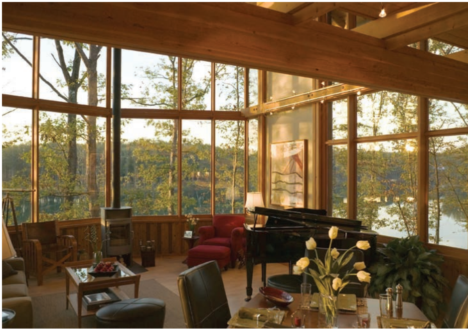
Classic Far Horizon - 38917 MO

Lindal interiors are noted for their stunning transparency that makes the natural environment an important part of everyday home life. This soothing oneness with nature is underscored by the use of beautiful Douglas fir beams that form the structural skeleton of the house, as well as the golden cedar used to line the underside of sweeping roofs, for windows, and a variety of modern trim styles. Lindal interiors have been described as “relaxed, restful, soothing, and radiant”, words hardly suited for prefabs that struggle to rise above boxy.