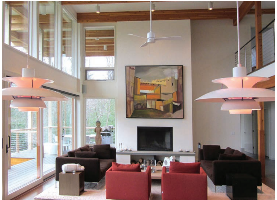
Elements Tucana 4010 - 41180 NY

Lindal's legendary prefab product is a kit of refined wood components and specialty items curated to complement their style. Our homes are crafted of Pacific Northwest premium lumber, valued worldwide for its unequaled quality. There is no need to supply ordinary items that can be purchased locally rather than transported across the miles. This quality is the basis for the Lindal Lifetime Structural Warranty (the industry's only such warranty) and is noted with audible approval – almost wonderment – when builders everywhere take delivery of the Lindal product.